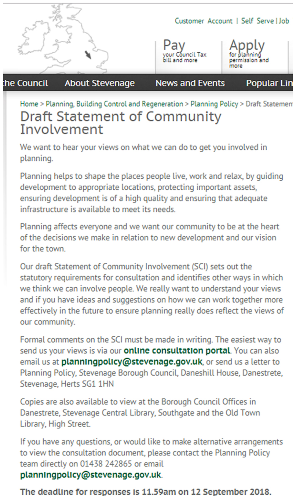
Figure 1 Stevenage Borough Council Website

27 Images of the advertisements and web pages are shown below: